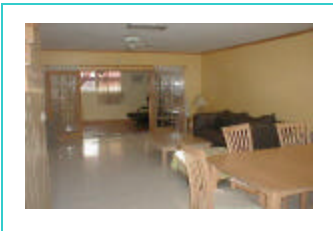
Living & Dining Room

This charming 2 bed, 2 bath canal-front townhouse is situated in the Bell Channel Subdivision. This condo is gated and has well-landscaped grounds and a pool. This unit has ownership in the adjoining vacant property, which allows for a private entrance and use as a picnic area. This home has been completely refurbished and is ready for you to move in.