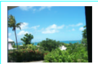
Distant Ocean views